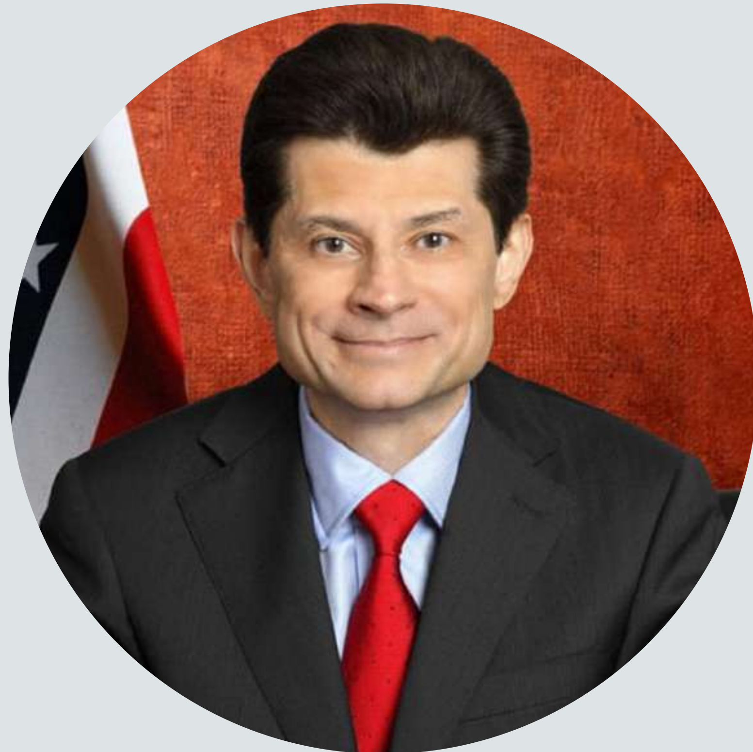
Co-Founder Life Extension Buyers Club, Inc. and Society for Rescue of Our Elders.